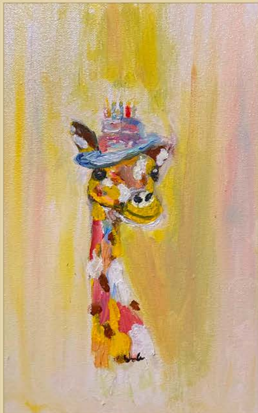
OIL ON CANVAS

I N ADDITION TO DIGITAL ART, I ALSO CREATE PAINTINGS USING OIL AND ACRYLIC COLOR TECHNIQUES. I LIKE TO CHALLENGE MYSELF AND EXPERIMENT WITH VARIOUS TECHNIQUES.