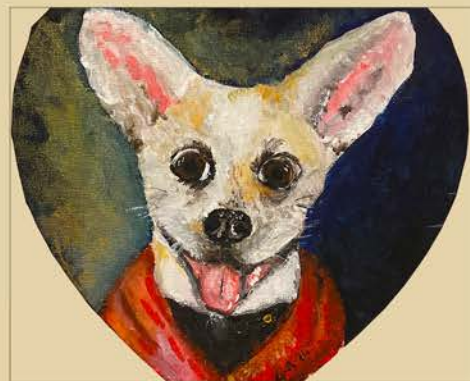
ACRYLIC ON CANVAS

T HIS IS A SMALL SELECTION OF SOME OF THE WORKS CREATED