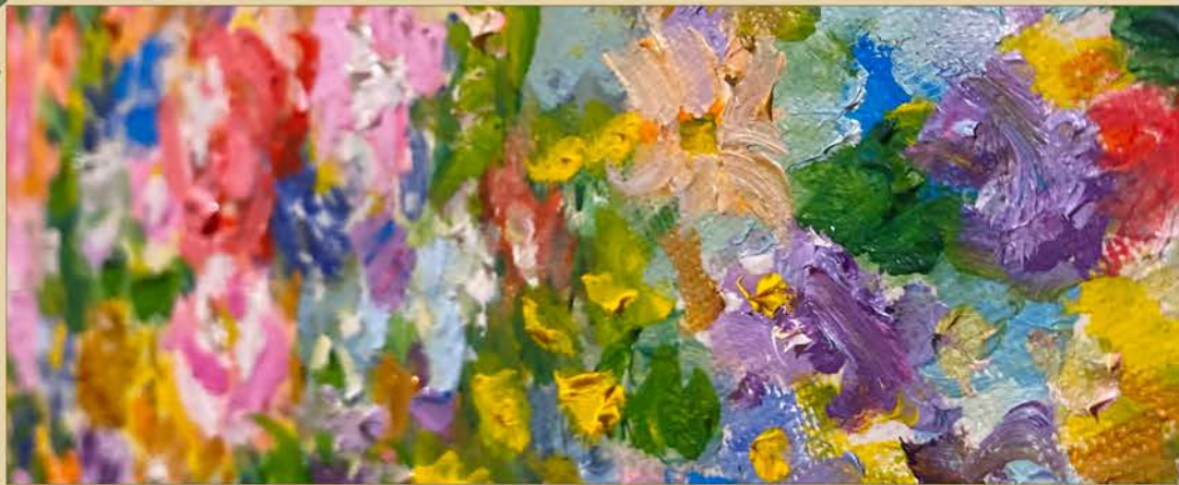
OIL ON CANVAS

I DEEPLY LOVE NATURE; IT INSPIRES ME WITH ITS SHAPES AND COLORS, WHICH I TRANSFORM INTO ILLUSTRATIONS AND PAINTINGS