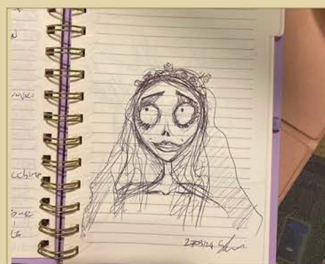
I'M DEEPLY PASSIONATE ABOUT THE ARTISTIC WORLD OF TIM BURTON.