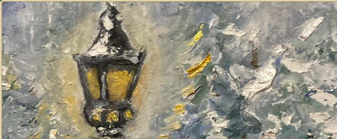
OIL ON CANVAS

I N ADDITION TO DIGITAL ART, I ALSO CREATE PAINTINGS USING OIL AND ACRYLIC COLOR TECHNIQUES. I LIKE TO CHALLENGE MYSELF AND EXPERIMENT WITH VARIOUS TECHNIQUES.