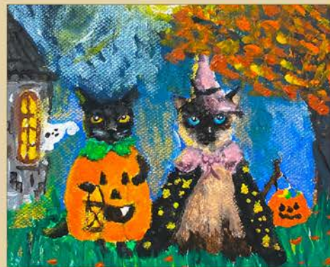
ACRYLIC ON CANVAS