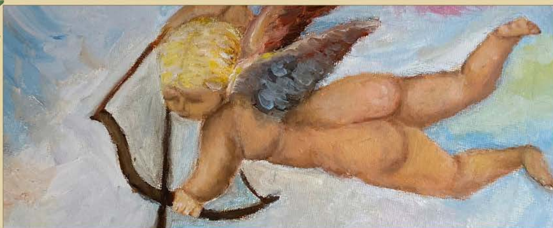
OIL ON CANVAS, WORK IN PROGRESS IL TRIONFO DI GALATEA DI RAFFAELLO SANZIO